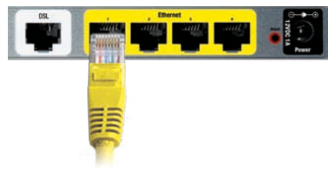
Connect the Computer

3. Repeat step 2 for every computer or device that you want to connect to the Gateway via Ethernet. If you connect more than four computers to the Gateway, you also need to connect a switch to the Gateway.