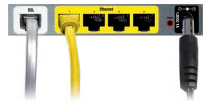
Connect the Power