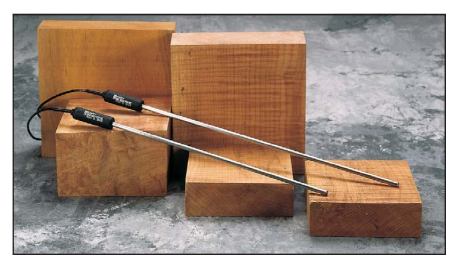
Figure 1 Hart Model 5626 and 5628 Platinum Resistance Thermometers

Hart 5626 and 5628 thermometers are classified as secondary standards. A secondary standard is defined in terms of transfer of the ITS-90 from a standards laboratory to a customer's laboratory. Secondary standards are