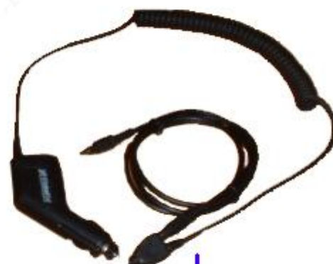
Car charge adaptor