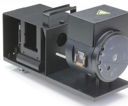
The Internal Diffuse Reflectance Accessory