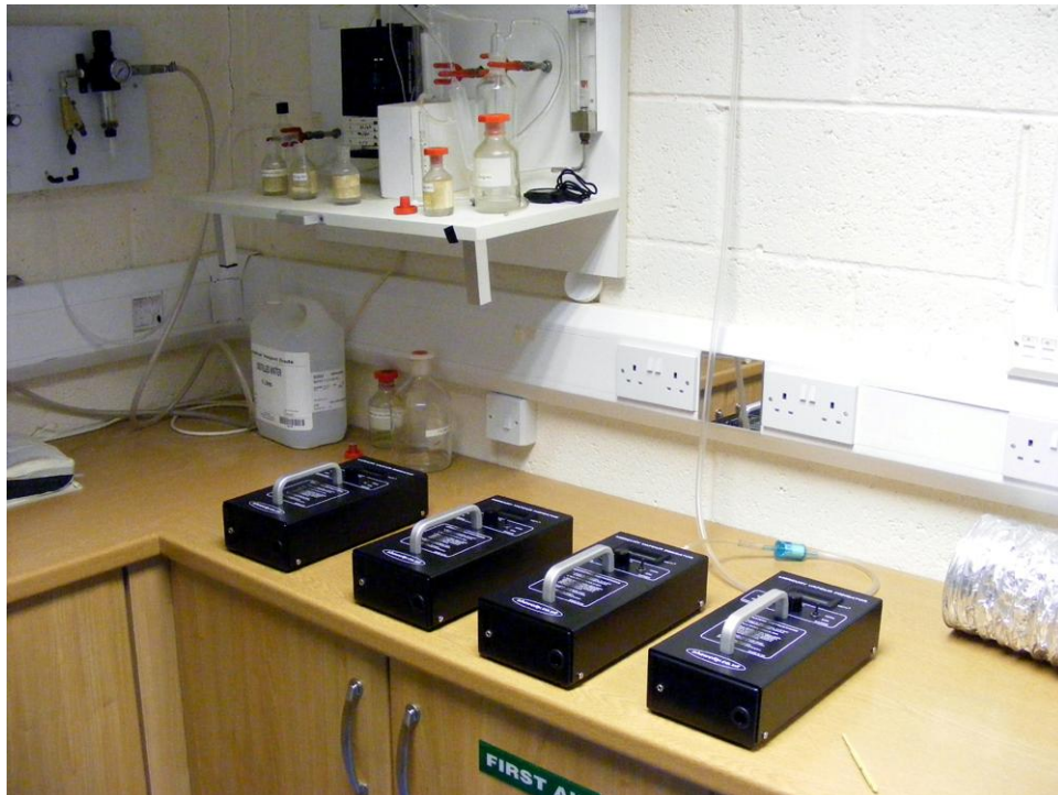
Shawcity Calibration Room

For further information please contact our Service Department on + 44 (0) 1367 241675 or via email on service@shawcity.co.uk and they will be pleased to assist you.