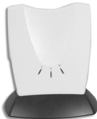
FIGURE 1. SAMPLE PLASTIC ENCLOSURE