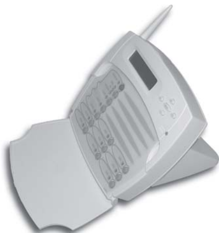
table top model