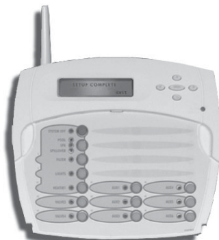
wall mount model