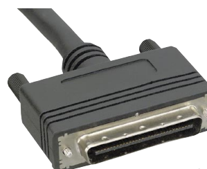
H.P. CEN60 (M)

RS6000 to SCSI 1 Cable, H.P. CEN60 (M)/CEN50 (M) 5' Cat. No. 45-0884-0000