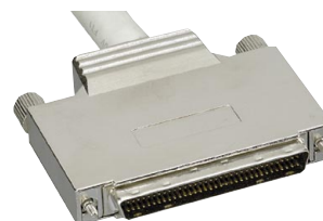
H.P. DB68 (M)

SCSI 2 to SCSI 1 Cable, H.P. DB50 (M)/CEN50 (M) 10' Cat. No. 45-8210-0000