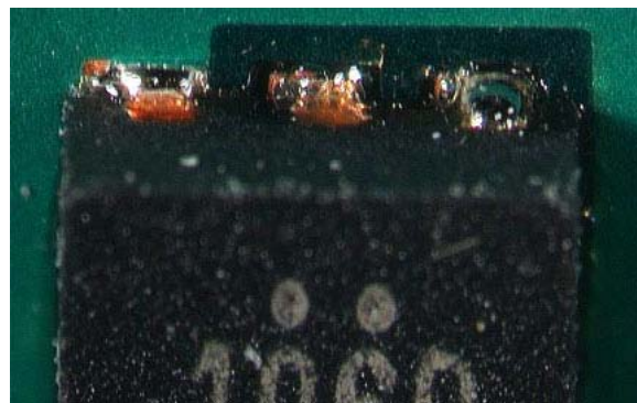
Figure 2: Exposed copper on package edge, with solder wetting after reflow, from singulation process.

designed to allow for tolerances in PWB fabrication and pick and place, which are necessary for proper solder fillet formation. MLP packages, when the pre-plated lead-frame is sawn, show bare copper on the end of the exposed edge leads. This is normal, and is addressed by IPC JEDEC J-STD-001C “Bottom Only Termination”. In practice it has been found that optimized PWB pad design and a robust solder process often yields solder fillets to the ends of the lead due to the cleaning action of the flux in the solder paste.