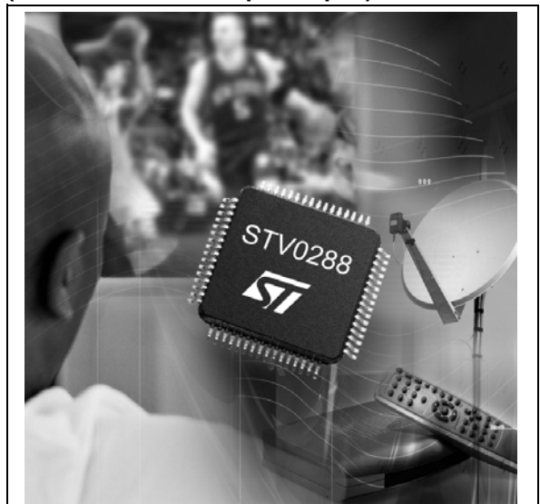
Figure 1. Package (TQFP64 with non exposed pas)

The device operates up to 120 MHz and can process variable modulation rates, up to 60 Msp. The chip outputs MPEG transport streams and interfaces seamlessly to the packet demultiplexers embedded in the ST Omega chip family. Its low power consumption, small package and low bill of material makes it perfect for all satellite applications.