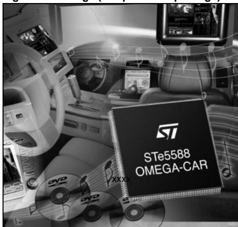
Figure 1. Package (208 pin PQFP package)