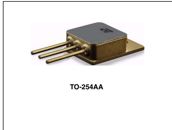
Figure 1. Device configuration

The complete ESCC specification for this device is available from the European space agency web site. ST guarantees full compliance of qualified parts with such ESCC detailed specifications.