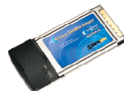
SparkLAN WL-611R 11g Cardbus