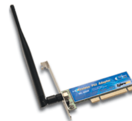
SparkLAN WL-660R 11g PCI Adapter