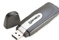
SparkLAN WL-685R 11g USB Dongle