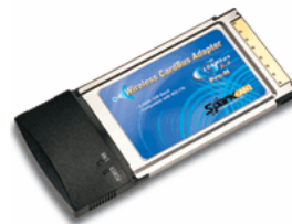
WPCR-300 Wireless MIMO-G CardBus Adapter