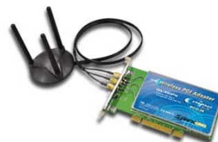
WPIR-300 Wireless MIMO-G PCI Adapter