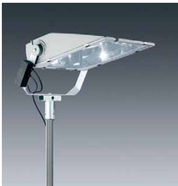
尺寸图 (Dimension Drawing):