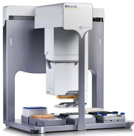
The Bravo has nine deck positions and can be configured with interchangeable 8-, 16-, 96-, or 384- fixed and disposable tip heads.

This technical note describes a method to measure the accuracy and precision of the Bravo in