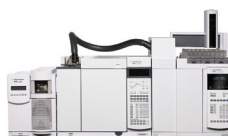
7890A GC system with 7697A Headspace Sampler and 5975C Series GC/MSD system