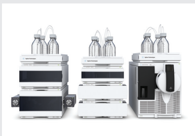
1200 Infinity Series Multi-Method Solution

Purity analysis solutions in discovery and development workflows