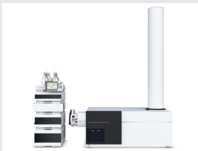
1200 Infinity Series LC and 6500 Series Accurate-Mass Q-TOF LC/MS Systems