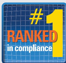
Regulatory Compliance & Quality Testing Services

Purity analysis of chiral and polar compounds