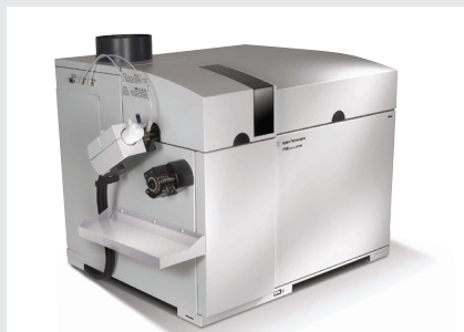
7700 Series ICP-MS System