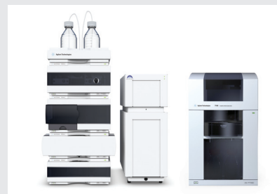
1260 Infinity Analytical SFC and 7100 Capillary Electrophoresis Systems

Purity analysis of chiral and polar compounds