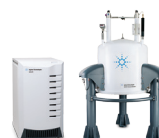
400-MR DD2 NMR system