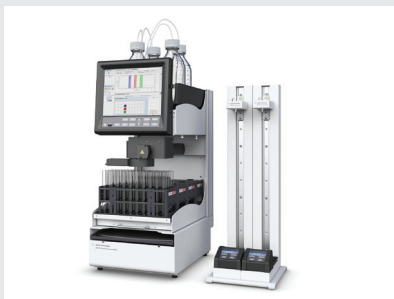
971-FP Flash Purification System

Purification of routine synthetic mixtures by flash chromatography