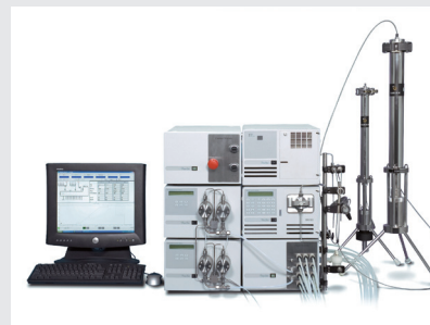
PrepStar SD-2 System for High-Throughput Purification

Large-scale purification solutions for process chemists