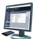
OpenLAB CDS software