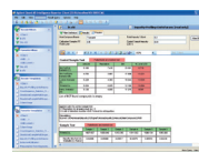
OpenLAB ECM software