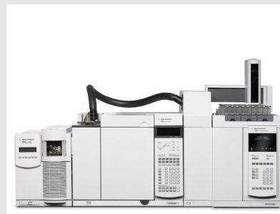
7890A GC System with 7697A Headspace Sampler and 5975C Series GC/MSD System

Visit www.agilent.com/lifesciences/realizepharma to see a detailed overview of the various technologies available to address the challenges faced by the pharmaceutical industry in purification, purity analysis and impurity analysis.