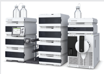
1260 Infinity Preparative-Scale LC/MS Purification System

Small-scale purification solutions for medicinal chemists