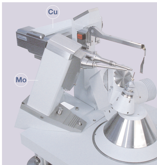
Co-mounted Enhance Ultra (Cu) and Enhance (Mo) X-ray sources.

Available to buy outright or as an upgrade, the Enhance Ultra can be co-mounted alongside the Agilent Technologies hi-flux molybdenum Enhance thus providing an X-ray source which is ideal for both small molecule and protein applications.