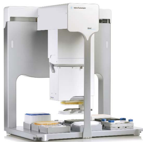
The Agilent Bravo has nine deck positions and can be configured with interchangeable 8-, 16-, 96-, or 384-fixed and disposable tip heads.

60 mL of tartrazine solution is poured into a manual fill reservoir. The reservoir is placed on position 2 of the Bravo. A 70 \mu L tip box is placed on position 6. A 384-well polystyrene plate is placed on position 5. Agilent VWorks software liquid classes for 0.75-1 \mu L and 1-5 \mu L