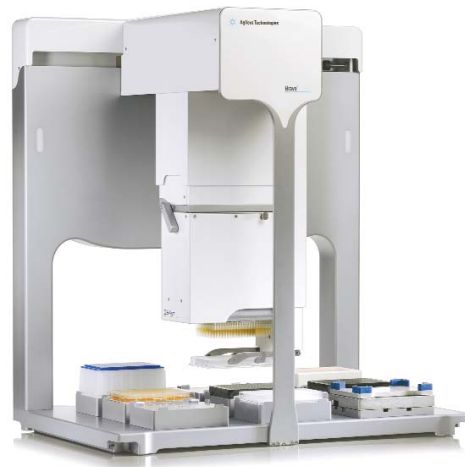
The Agilent Bravo has nine deck positions and can be configured with interchangeable 8-, 16-, 96-, or 384-fixed and disposable tip heads.