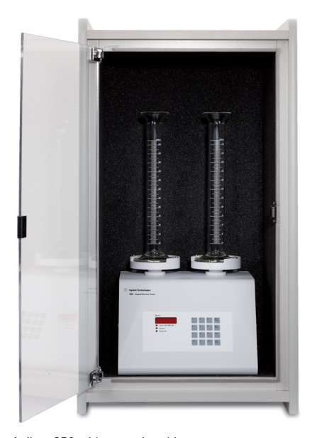
Agilent 350 with acoustic cabinet.

The 350 Tapped Density Tester measures the tapped or packed volumes of powders, as well as granulated or flaked materials. The tester is available in two models that are compliant with USP and ASTM standards for tapped density testing.