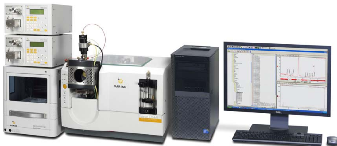
Figure 1 Suggested Layout with 212-LC and 460-LC

Figure 1 shows a possible layout for the LC/MS with the 212-LC pumps and the 460-LC AutoSampler.