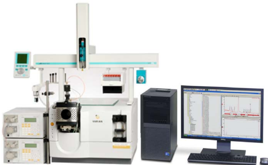
Figure 2 Suggested Layout with 212-LC and HTS PAL

Figure 2 shows a possible layout for the LC/MS with 212-LC pumps and CTC HTS PAL Autosampler.