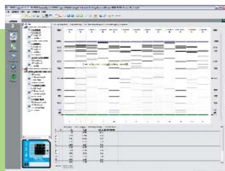
Analyze and compare

Setup of samples, choice of method and start of run is conveniently available from an intuitive user interface giving access to Agilent 2100 Bioanalyzer instruments.