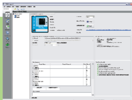
Setup and start

Setup of samples, choice of method and start of run is conveniently available from an intuitive user interface giving access to Agilent 2100 Bioanalyzer instruments.