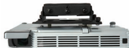
Ceiling Mount Commercially Available (Optional and Sold Separately)