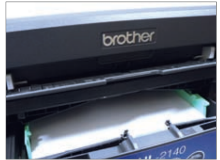
The single sheet manual feed slot and paper input tray.