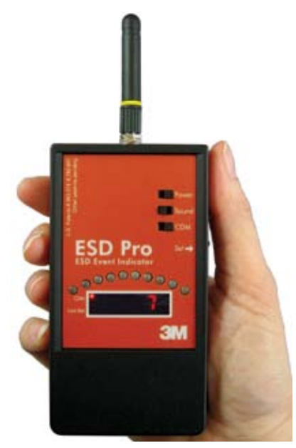
3M<sup>™</sup> ESD Pro Event Detector, CTM082