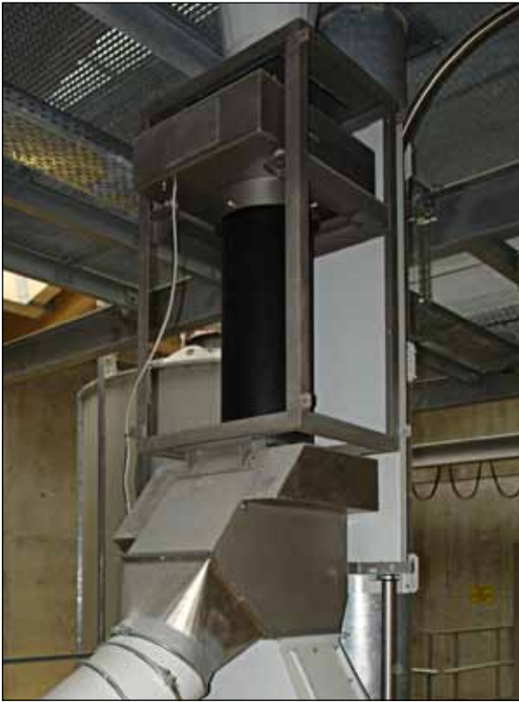
Metal separator RAPID DUAL used for machinery protection during wood pellet production