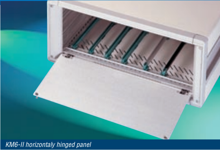
KM6-II horizontally hinged panel