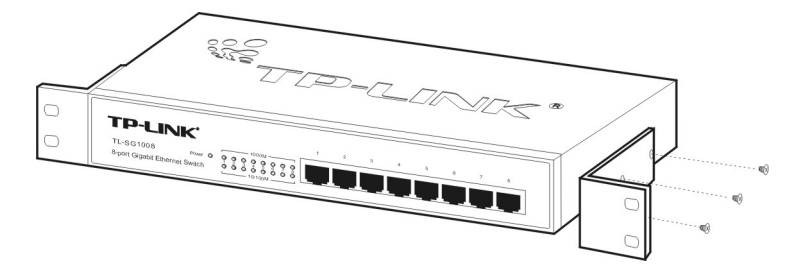
Figure 2-1 Rivet the "L" brackets onto the Switch