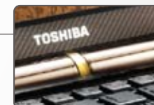
Centralized Power Button