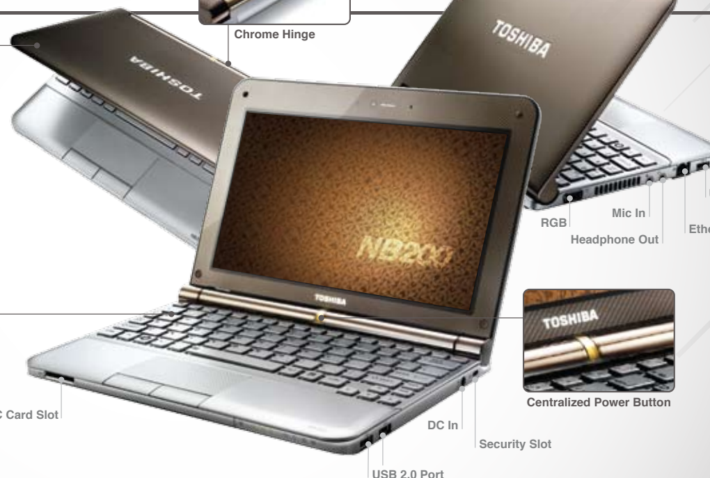
SD / SDHC / MMC Card Slot