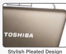
Stylish Pleated Design