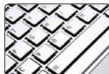
Tiled-style, Full Size Keyboard