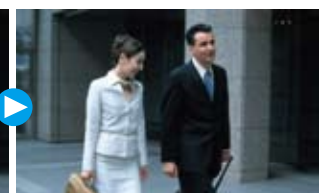
SteadyShot w/Active Mode on