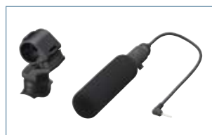
Supplied Microphone and dedicated holder