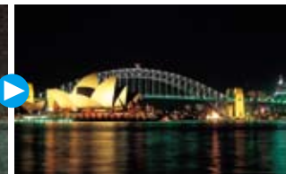
HXR-MC50U (Exmor R)