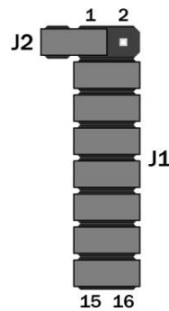
MON08 Connector Jumpered for Standalone Mode Operation

In order for the IDB-HC08JK Evaluation Board to work in standalone mode, the MON08 connector's pins must be jumpered as show below (factory setting).