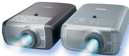
* bSure XG2 bSure SV2