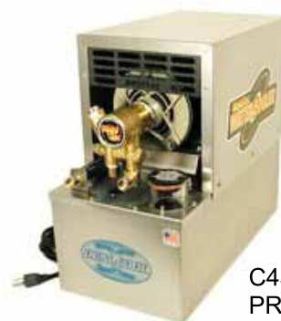
C45 PREMIUM - DUAL COOL (4 Gallon)

MODEL C25 STANDARD C35 DELUXE C45 PREMIUM - DUAL COOL™