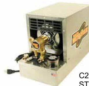
C25 STANDARD (2 Gallon)

TEC WELDING PRODUCTS, INC. P.O. Box 1870 • San Marcos, CA 92079 • Phone 760-747-3700 www.tectorch.com www.weldtec.com