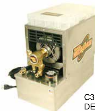
C35 DELUXE (3 Gallon)