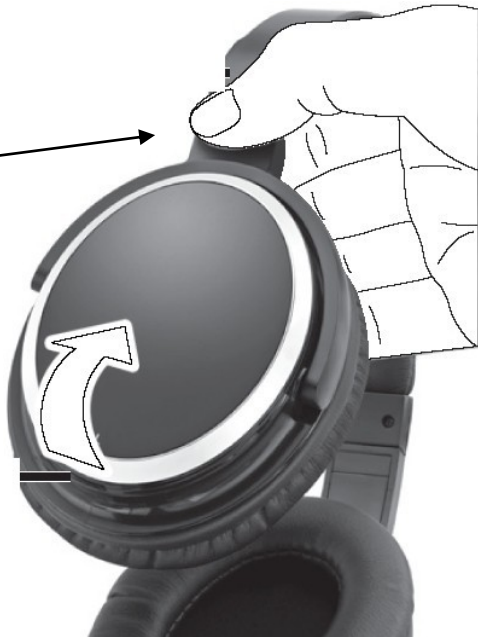
Opening Battery Compartment

Confirm the left/right orientation by the L/R marks on the inside of the ear-cups/ headband. Then rotate the ear-cups (they swivel 90 degrees). Place the headphones on your head and adjust the length of the headband for the most comfortable fit. Length of headband is adjustable to accommodate various head sizes.