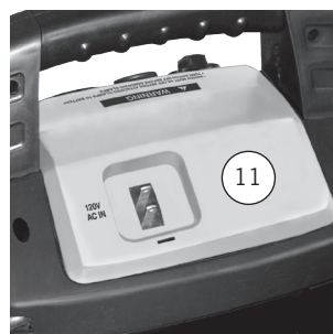
RUBBER CAP REMOVED FOR CLARITY