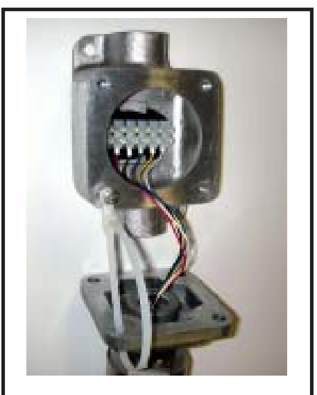
Figure 900-4 Wiring

Remove the 4 screws from the junction box cover for access to the wiring terminals. The sensor may be mounted in the box cover, or in one of the side outlets of the junction box. If the sensor is mounted in the box cover, use the provided nylon strap to temporarily hold the cover while connecting the sensor wires to the terminal block. Do not let the cover and sensor hang on the connection wires, as the wires may be loosened from the terminal blocks due to the weight of the stainless steel housing. Then connect 24 volt DC power supply and monitoring equipment wires to the screw terminals in the junction box as shown in the drawing.