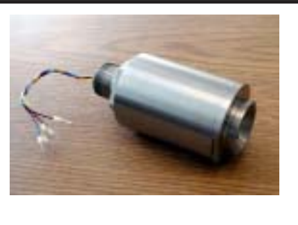
Figure 900-1 GIR900 Sensor

The GIR900 uses the absorption of hydrocarbons in the 3.3 \ \mu m to 3.5 \ \mu m range for the detection of any hydrocarbon gas. The absorption of the hydrocarbon compounds is a result of the oscillation of the H-C structure when ex-