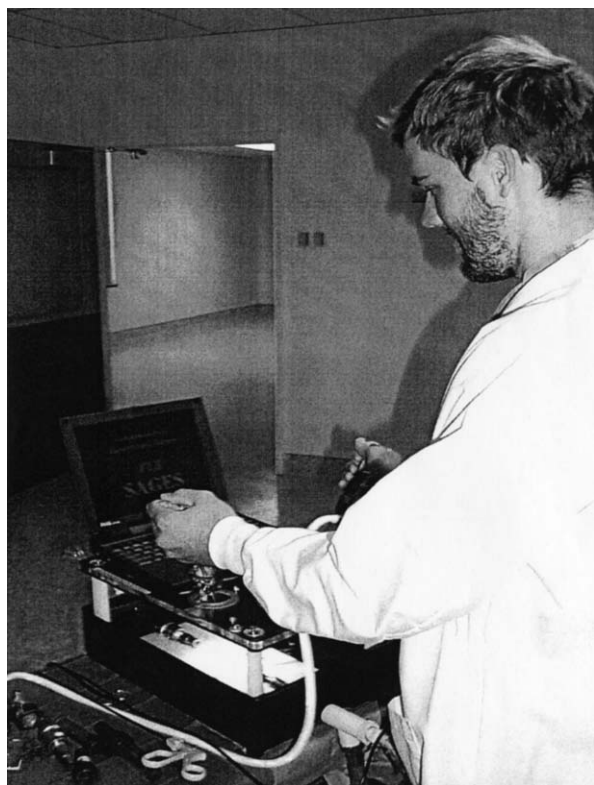
Fig 1. Laparoscopic skills simulator used for practice and for testing.

Test validity. The use of the exercises for training or assessment requires evidence that they are representative of the domain of manual skills in basic laparoscopy. Experienced laparoscopic surgeons assembled a list of 14 skills commonly required in basic laparoscopic procedures. Participants in the beta testing ( n = 44 ) were asked after completing manual skills assessment to indicate which of the listed skills was required for successfully completing each of the FLS exercises. The majority of participants felt that 11 of the listed skills were incorporated in 1 or more of the exercises. Four of the skills were viewed as required by all the exercises, and 3 of the skills seemed to be only required by 1 of the exercises. Global ratings on the exercises revealed that beta test respondents felt they would be useful for training and that the skills required were similar to those required by actual laparoscopic surgery.