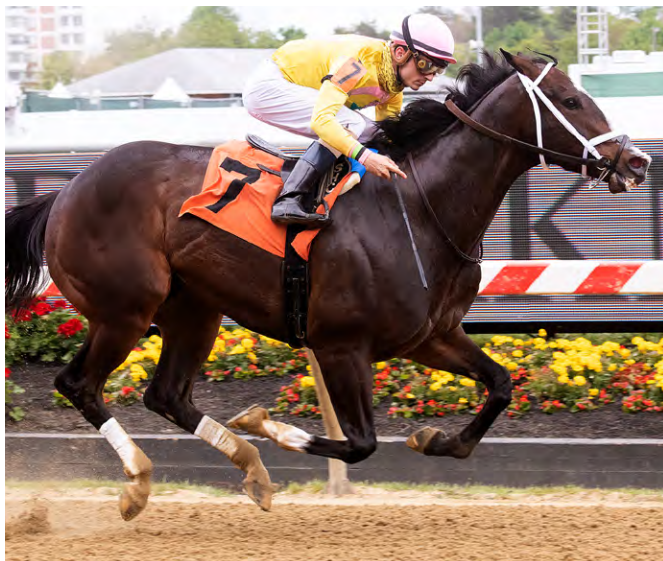
Spice Is Nice winning the 2021 Allaire Du Pont at Pimlico Race Course.

Run as Pimlico Distaff Handicap 1992-2001. Run as Pimlico Distaff Breeders' Cup Handicap 2002-2005. Distance 1-1/8 miles 1992-2001. First graded in 1994. Grade II 2007-2009. Not run 2010, 2014.