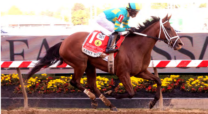
Army Wife winning the 2021 Black Eyed Susan Race at Pimlico Race Course.