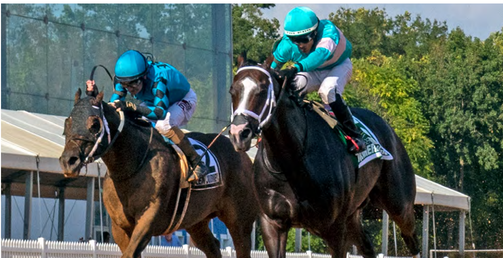
Jalen Journey (outside) was elevated to first in the 2021 DeFrancis Dash.

The Frank J. De Francis Memorial Dash is one of the elite sprints in the country.