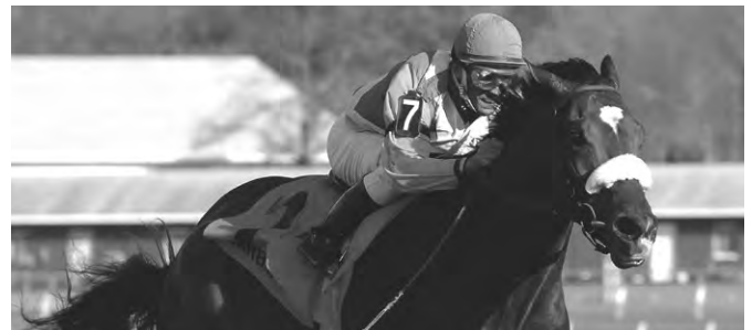
With his victory in the 2006 Kentucky Derby, Barbaro became the 16th Laurel Futurity winner to go on to capture a Triple Crown race at three.

Not run in 1933, 1934, 2001, 2008-2010. Distance 1 mile from 1921-1928; 7-1/2 furlongs in 1994 & 1995; 1-1/8 miles from 1996-2000; 1-1/16 miles from 2002-2007; 5-1/2 furlongs from 2012-2016. Run as Pimlico Futurity prior to 1967; as Pimlico-Laurel Futurity from 1967-1971. Run at Pimlico prior to 1967 and in 1979. Run on the main track 1921-1986, 1989, 1994-2004. Grade I 1973-1988; Grade II 1989; Grade III 1990-2004.