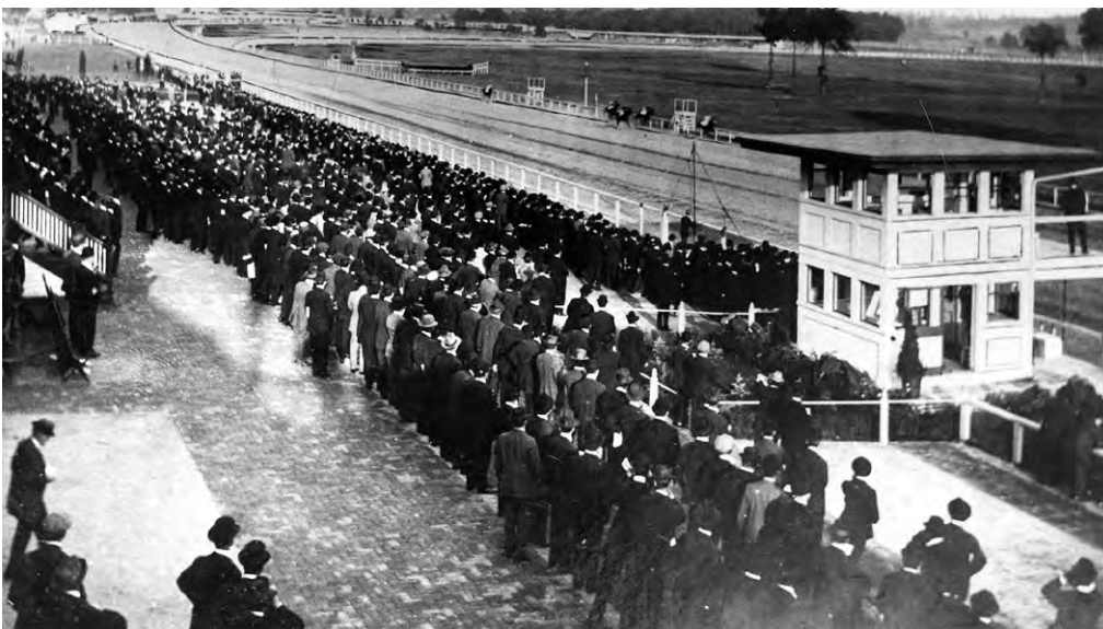
Laurel Park opened on October 2, 1911.