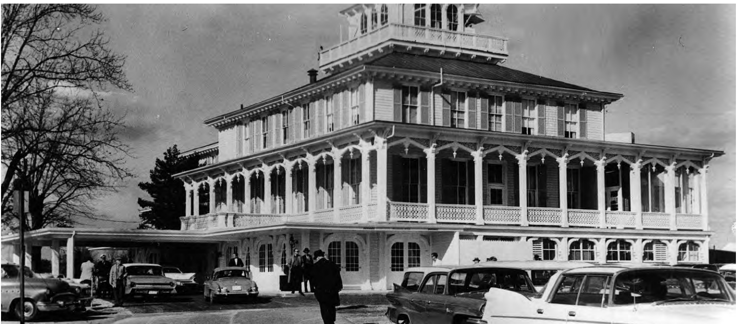
The Pimlico Members' Clubhouse circa 1959.