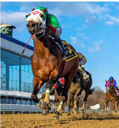
2021 General George winner Share the Ride

The race was first Graded in 1991 and now joins the Barbara Fritchie (G3) to complete the Winter SprintFest, which has become the highlight of Laurel Park's winter meet.