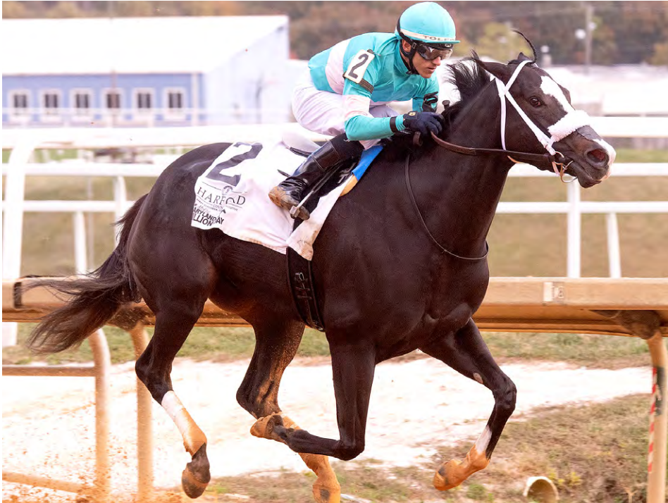
Hello Beautiful winning the 2021 Maryland Million Distaff.