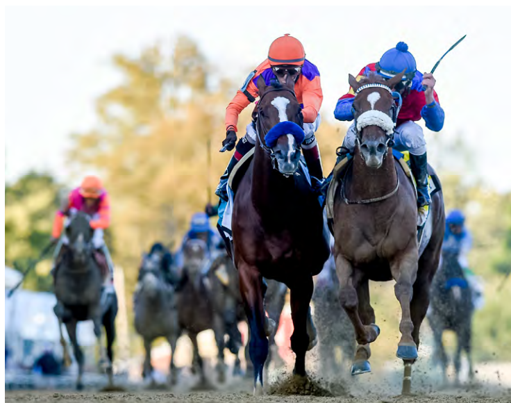
Pimlico is home of the Preakness, the middle jewel of racing's Triple Crown.