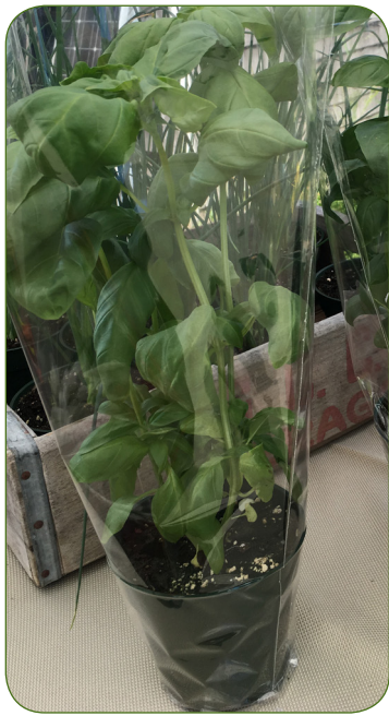
Basil plant ready for market, protected by Johnny's medium-size Cut Flower Sleeve