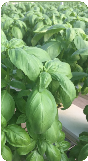
Aroma 2, grown hydroponically