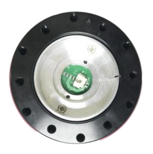
This is the factory standard setting. Only use simple and fast single lock