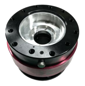
After opening the quick release second lock, To remove the quick release, press the button to remove it