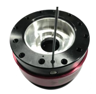
Use a wrench to loosen the screw Manual lock can be opened