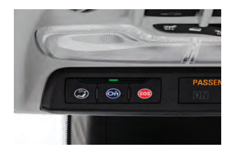
See OnStar and Connected Services in your Owner's Manual.

To learn more about Connected Services, press the blue OnStar button, visit onstar.com, or call 1-888-466-7827.