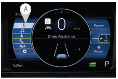
See Instruments and Controls in your Owner's Manual.