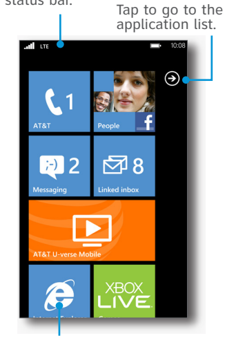
Tap a tile to open the application or

Tap the top of the screen to display the status bar.