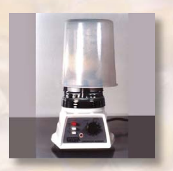
2. Cover blender and grind