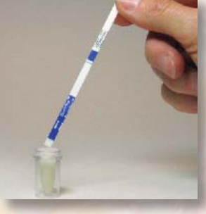
4. Insert strip with arrows pointing down; wait 5 minutes