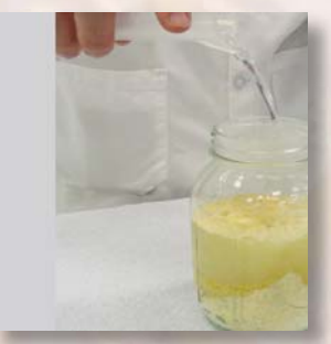
1. Measure and add water to jar or bag