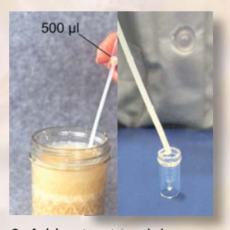
3. Add extract to vial