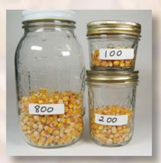
1. Determine sample weight and place in properly sized jar