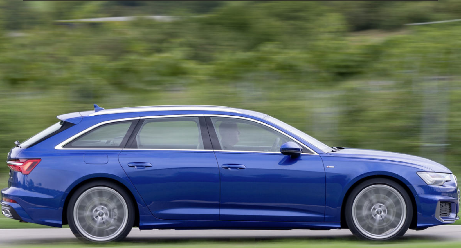
*The CO2 figures have been determined according to the Worldwide Harmonized Light Vehicles Test Procedure (WLTP). These figures may not reflect real life driving results, which will depend upon a number of factors including the starting charge of the battery (where applicable), options fitted, accessories fitted (post-registration), variations in weather, driving styles and vehicle load.