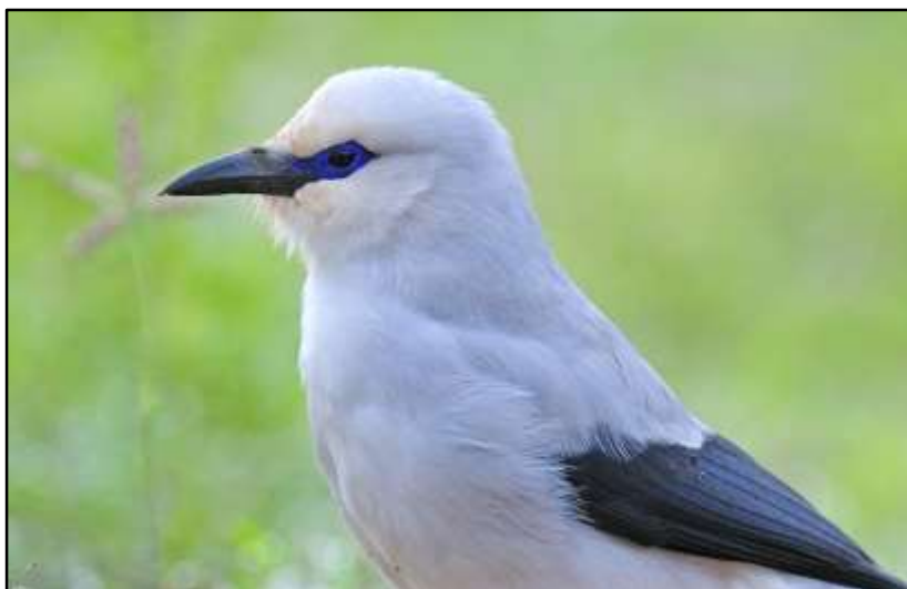
Stresemann’s Bushcrow by Rich Lindie

White-winged Collared Dove and Black-bellied Sunbird. Other noteworthy birds we may encounter en route to Yabello include Somali Courser, Magpie Starling, Black-throated and D’Arnaud’s Barbets, Pygmy Batis, Acacia Tit, Dodson’s Bulbul, Red-fronted Warbler, Purple Grenadier, Black-capped Social Weaver, Steel-blue Whydah and its host, Black-cheeked Waxbill.