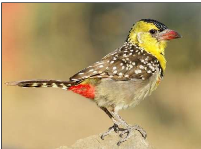
Yellow-breasted Barbet by Rich Lindie

This land is inhabited by nomadic Afar tribesmen who we will see dressed in their fine white cotton tunics, bedecked with traditional jewellery, daggers and spears. The men sport a unique bushy hairstyle, while women and girls are also extravagantly attired and adorned. They adhere strictly to their ancestral ways of tending their camel and goat-herds and roaming throughout this inhospitable land.