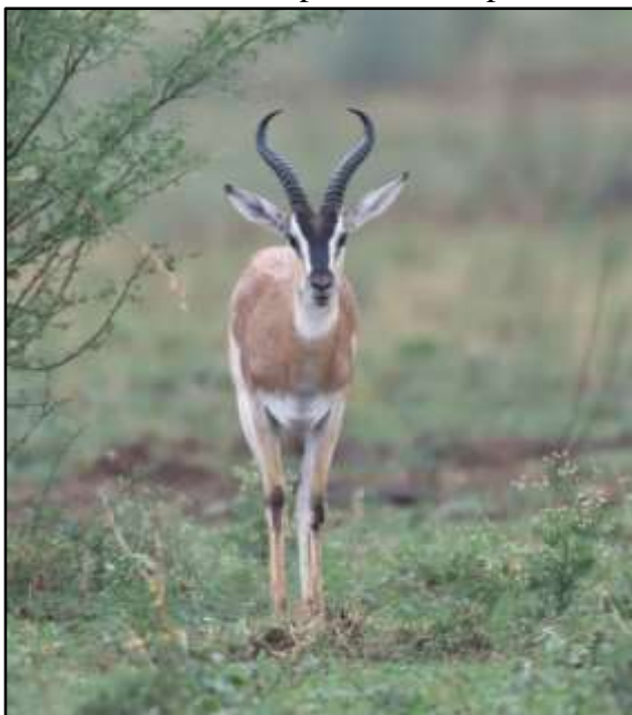
Soemmerring's Gazelle

We will then head to the magnificent Awash National Park where we will bird the Awash River and Kirayawa Gorge, exploring riverine forests, wetlands, Acacia woodlands, savannah grasslands, rocky hills, cliffs and escarpments. The park boasts a bird list of around 460 species and we will make an effort to find, amongst many others,