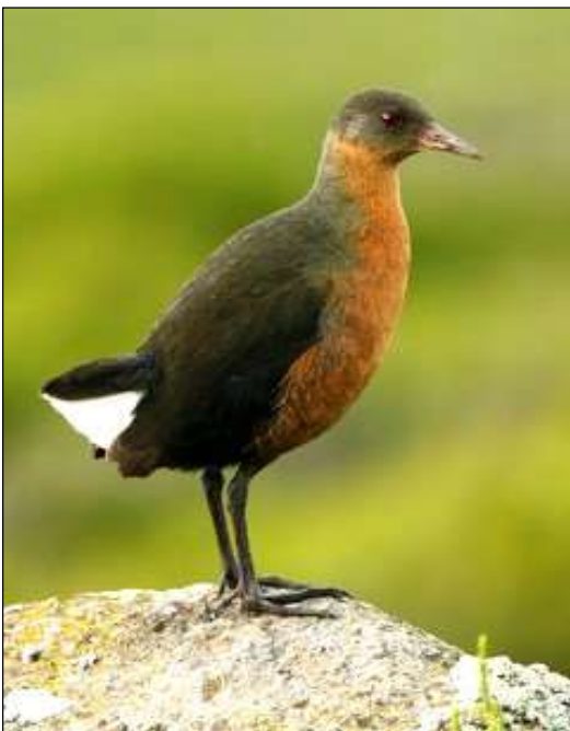
Rouget's Rail by Matthew Matthiessen

Day 5: Goba to Haremma Forest, via Bale Mountain National Park. This will be a day of great contrasts and amazing scenery and birding. We will depart early and ascend the Bale Mountain massif onto the Sanetti Plateau, which lies between 3,800m and 4,377m (12,540 and 14,444ft) above sea level. As we climb out of Goba, we enter a Tid or Juniper forest zone, where we will search for African Goshawk, Rufous-breasted Sparrowhawk, White-cheeked Turaco, the localised Abyssinian Woodpecker, Cinnamon Bracken Warbler, African Hill Babbler, Montane White-eye and Yellow-bellied Waxbill.