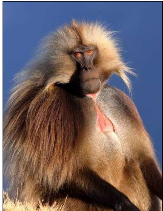
Gelada

Day 15: Aledoghi Wildlife Reserve to Debre Birhan via Melka Gebdu & Gemasa Gedel. Today we depart our lodge very early for the drive to north to Debre Birhan, skirting the majestic Ankober Escarpment for part of the way. Our route takes us through one of the least driven and most picturesque roads in the entire country, although major road improvements in this area are sure to change this. Our first stop of the day will be at the typically hot and dry Melka Gebdu track, where our primary focus will be on finding another scarce endemic, Yellow-throated Seedeater. This area is also excellent for Yellow-breasted Barbet, Bruce's Green Pigeon, Bare-faced Go-away-bird and a number of sunbirds. Red-billed Pytilia, a rare and tricky endemic has also been recorded here.