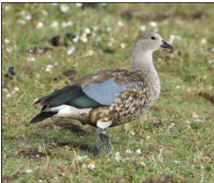
Blue-winged Goose by Clayton Burne

After reaching the escarpment, we may make the odd road side birding stop for Blue-winged Goose, Abyssinian Longclaw, Erlanger's Lark or Thick-billed Raven. This afternoon we shall reach Gemasa Gedel, an excellent site for the localised Ankober Serin, a rare and elusive Ethiopian endemic. Discovered only in 1976, they survive along a few kilometres of this wind blasted grand escarpment, as do Gelada Baboons, also known as Lion-headed Baboons. This densely-pelted, shaggy baboon is endemic to Ethiopia, and the males can often be seen flipping back their lips in a show of dominance. These animals have the closest vocal repertoire to humans of any mammal, pronouncing all consonants and four vowels! They forage on the grasslands above the escarpment and roost on ledges of inaccessible cliffs at night. Other possible species to be found here include Ethiopian Siskin, Streaky Seedeater, Moorland Chat, White-billed Starling, Bearded Vulture, Verreaux's Eagle, Rufous-breasted Sparrowhawk, Peregrine Falcon, the seldom recorded Somali Starling and Long-billed Pipit. In the afternoon we will then retire to our comfortable hotel in Debre Birhan.