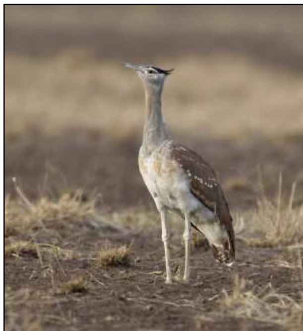
Arabian Bustard

Mammals are also well represented and we may see Aardwolf, Leopard (unlikely), Beisa Oryx, Aardvark, Soemmering's Gazelle, elegant Gerenuk (the giraffe-proportioned relative of the widespread Impala), Abyssinian Hare, African Wild Cat, Black-backed Jackal, Spotted and Striped Hyenas, Greater and Lesser Kudus, Warthog and Salt's Dikdik.