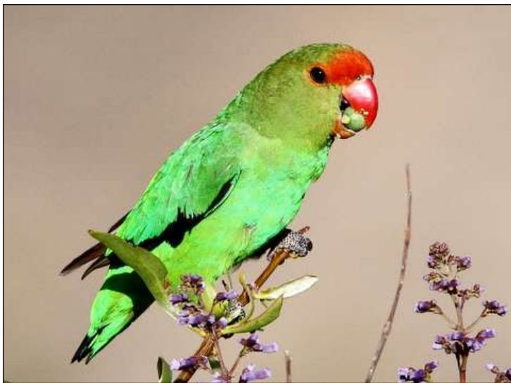
Black-winged Lovebird by Adam Riley

Day 6: Bale Mountain Lodge to Negele, via Haremma Forest. After some birding around the lodge we will head south towards Negele. As we lose altitude, we will exit the forest zone and enter