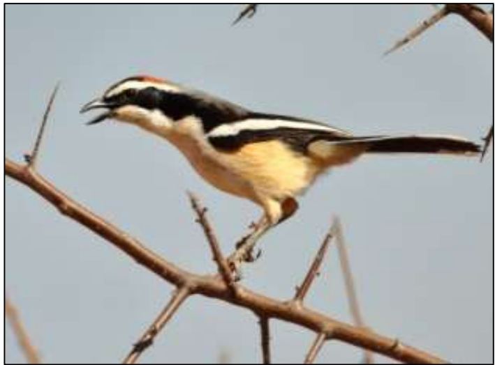
Red-naped Bushshrike

years before explorers saw the turaco again, and only in the 1970's was anything revealed about this bird. We will search fruiting fig trees along the wadi and, with the help of local farmers we should enjoy excellent views of this very unusual and beautiful turaco. We will arrive in Negele in the early evening and check into our basic hotel.