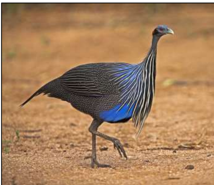
Vulturine Guineafowl

Day 8: Negele to Yabello. Today's drive along another long and seldom-travelled road takes us near to the Kenya border and finally to the Yabello region, home to two of Ethiopia's most sought-after