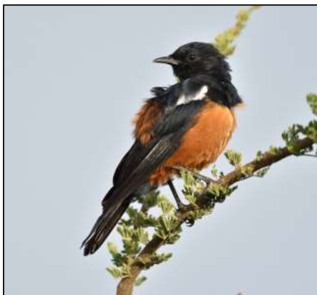
White-winged Cliff Chat by Clayton Burne

and it may prove difficult to keep up with the seemingly endless flow of lifers! Blue-breasted Bee-eater, Black-billed Barbet, Red-throated Wryneck, Rüppell's Robin-Chat, Western Black-headed Batis, Beautiful Sunbird, Rüppell's Weaver and a diverse variety of waterbirds can be seen here. Thereafter, the steep-sided Lake Bishoftu offers superb birding. Maccoa and Ferruginous Ducks, Singing Cisticola, gorgeous Tacazze Sunbird, Mocking Cliff Chat, Abyssinian Wheatear, Little Rock Thrush and flocks of Black-winged Lovebird are just some of our targets here!