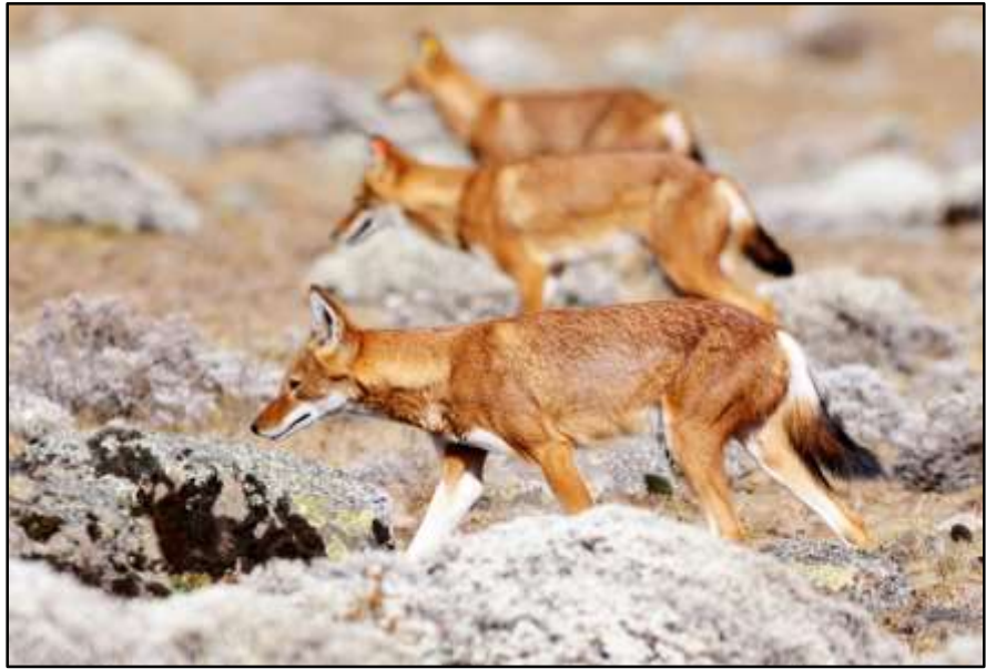
Ethiopian Wolves by Rich Lindie

wetter areas hold Rouget's Rail, Groundscraper Thrush (of the distinctive, endemic simensis subspecies), Blue-winged Goose and smart Spot-breasted Lapwing. At the park headquarters in Dinsho, we will search the trails for the colourful Chestnut-naped Francolin, secretive Abyssinian Ground Thrush, vocal Abyssinian Catbird and endemic White-backed Black Tit. With a healthy dose of luck, we may find roosting African Wood Owl and the highly sought-after Abyssinian Owl in the dark recesses of a Juniper thicket. We also hope to see a variety of mammals, including Mountain Nyala (now entirely restricted to the Bale Mountain massif), 'Menelik's' Bushbuck, Bohor Reedbuck and Common Warthog, unusual at this high altitude.