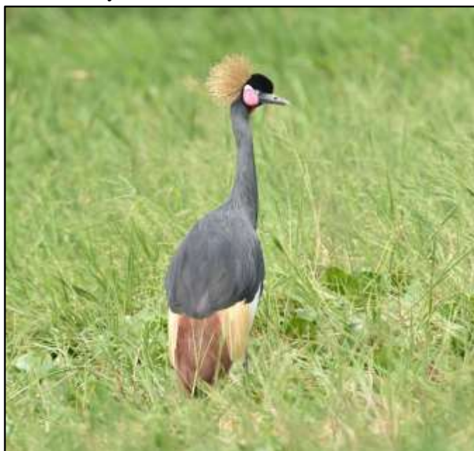
Black Crowned Crane by Clayton Burne

Day 3: Lake Langano area. Birding in the Langano area is especially good, and we will visit some beautiful fig forest and associated woodlands that teem with birds. Here we will look for Hemprich's and Silvery-cheeked Hornbills, Lemon Dove, Narina Trogon, Lesser and Scaly-throated