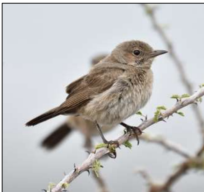
Sombre Rock Chat by Clayton Burne

Day 10: Yabello to Lake Awassa. Following breakfast, we will depart Yabello and make our way back north towards Addis Ababa on what is, essentially, a travel day. In the late afternoon we will reach our comfortable hotel, on the shores of Lake Awassa.