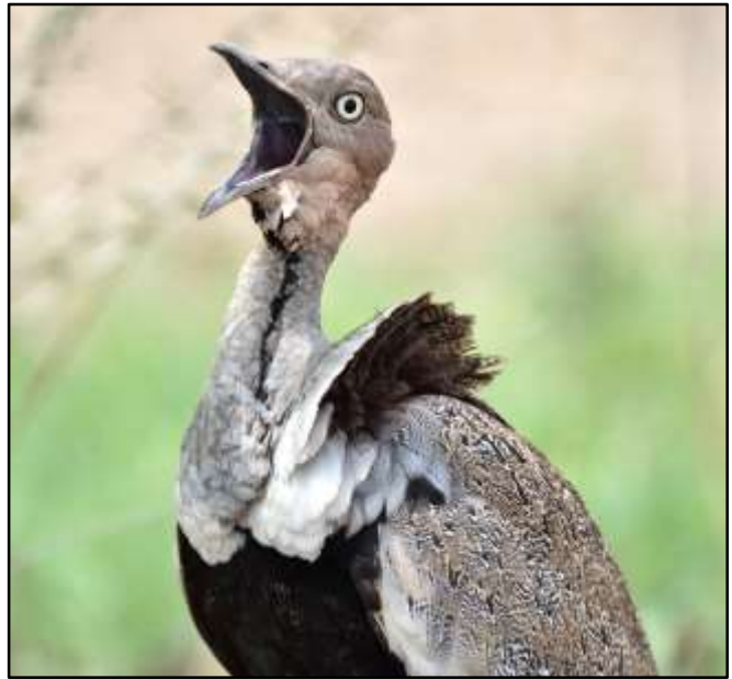
Buff-crested Bustard by Clayton Burne

After breakfast, we may then visit the remarkable Lake Awassa fish market. This large lake is particularly rich in fish, and the fishermen gut their catch and discard the waste around the market. This, in turn, attracts large numbers of grotesque Marabou Stork and other birds. Photographic opportunities are unrivalled. We should also see Great White Pelican, White-breasted and Reed Cormorants, Hamerkop, African Sacred Ibis, Black-headed, Grey-hooded and Lesser Black-backed Gulls, and sometimes the massively-equipped Thick-billed Raven squabbling over the fish remains.