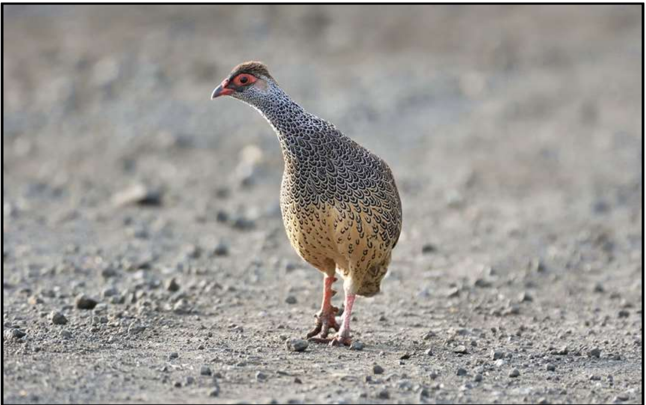
Harwood's Francolin

Ethiopia is hands-down one of Africa's most productive and rewarding birding destinations. A plethora of endemic birds, many of which are very tame and confiding is further complimented by a rich assemblage of forest and savannah species, rare mammals and a kaleidoscope of culture and food that combine to produce a fascinating and intriguing experience.