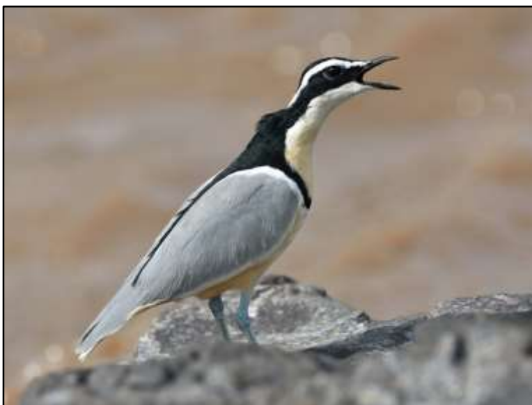
Egyptian Plover by Clayton Burne

Day 17: Gibe Gorge and depart. Another early departure will see us heading south-west out of Addis Ababa through Welkit and into Gibe Gorge. Our prime target here is the monotypic Egyptian Plover. For much of the year, the plovers are absent, to be found much further downstream on the larger Omo River. Once good rains have fallen, the Omo River floods sending the plovers up the Gibe River in search of more suitable habitat. The gorge is also one of only a handful of fairly reliable sites for the very difficult Red-billed Pytilia should we not have found it yesterday. Other important