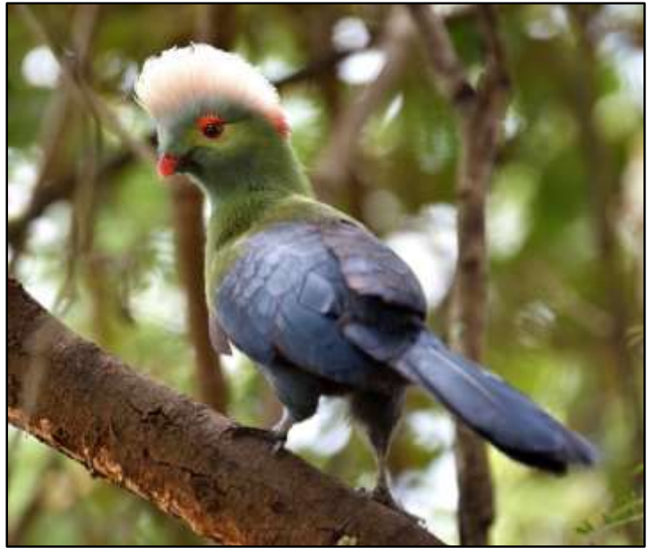
Ruspoli's Turaco

These grasslands are estimated to support an incredible biomass of 4,000kg (8,800lb) of rodents per hectare. This obviously attracts an array of raptors and we should see Steppe and Golden Eagles, Augur Buzzard and elegant Pallid Harrier courting over this green sea. They share this abundant food source with the plateau's most celebrated resident, the Ethiopian or Simien Wolf, crowned with the unenviable title of "the world's rarest canid." Watching these vibrantly coloured animals, most closely related to the European Timber Wolf, exhibiting their hunting prowess whilst pouncing on Giant Mole Rats (another endemic to the Sanetti Plateau) is surely among Africa's greatest wildlife experiences. We should enjoy excellent photographic opportunities in this unique montane habitat.