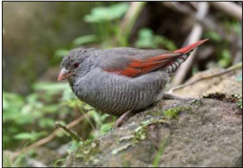
Red-billed Pytilia by Clayton Burne

(2,300ft) deep gorge through the landscape. The habitat in the gorge is dominated by Acacia woodland, while the steep sides provide habitat for some excellent endemic birds. We will concentrate our search here for Rüppell's Vulture, Verreaux's Eagle, African Hawk-Eagle, Augur Buzzard (dark morph birds are commonly seen here), Lanner and Peregrine Falcons, Erckel's Francolin, Nyanza Swift, Hemprich's Hornbill, Red-rumped Swallow, Abyssinian Wheatear, the endemic and localised Rüppell's Black Chat, endemic White-winged Cliff Chat and its more familiar cousin, Mocking Cliff Chat, endemic White-billed Starling, elusive Yellow-rumped Seedeater and Cinnamon-breasted Bunting.