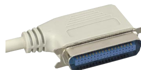
90° CEN36 (M)