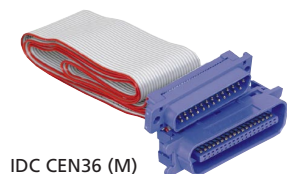
IDC CEN36 (M)